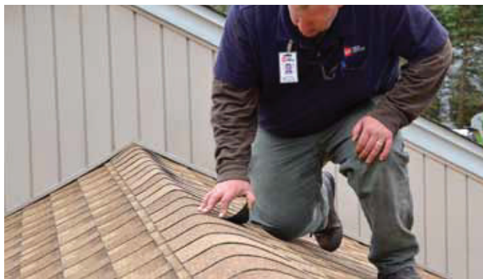
Ensuring ridge cap shingles are fastened properly and to the correct exposure, avoiding shingle blow-off.