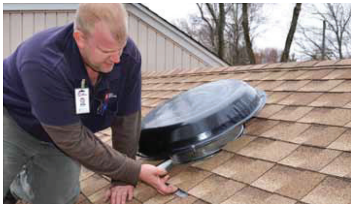
Ensuring attic ventilation and accessories are installed properly to maximize performance and prevent future leaks

PERFORMED BY GAF'S PROFESSIONAL INSPECTION TEAM