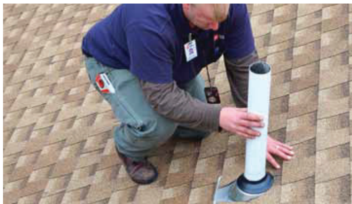
Ensuring flashings are installed properly to protect the roof deck and living space from water damage.